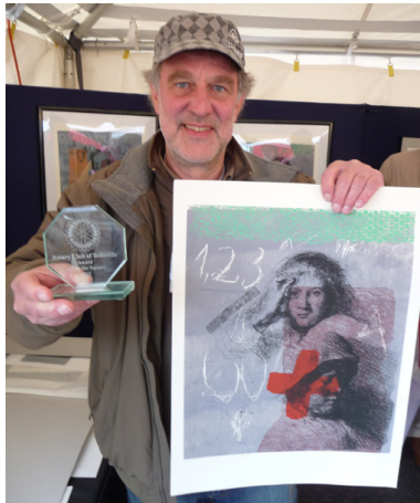
Art on the Square Award Winner!