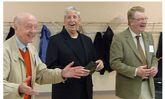
Laughter at St Michael's in Paderborn, IL