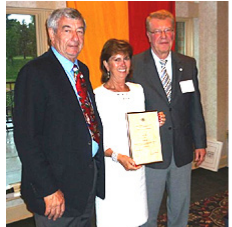
Honorary DAFK Members