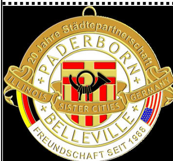
20th Anniversary Medal Presented to Anniversary Dinner Attendees